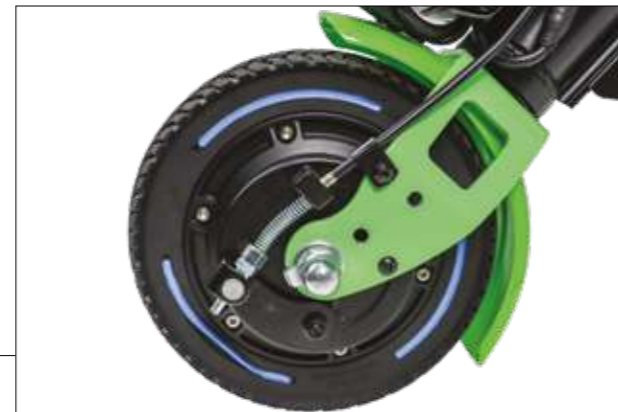
Dual braking system (drum and electronic brakes)